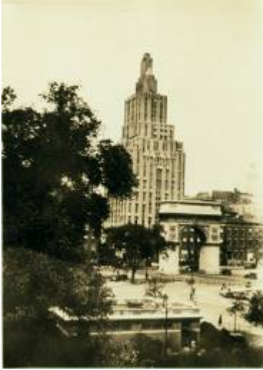
View of Washington Square Arch with One Fifth Avenue John Sloan 1927 Photograph Delaware Art Museum

During the turn of the twentieth century, New York City represented the idea of the “new metropolis,” a major city that was continually changing and expanding.