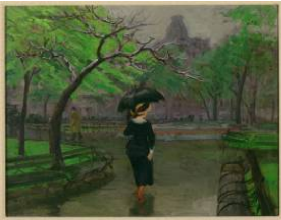
Spring Rain John Sloan 1912 Oil on canvas Delaware Art Museum Gift of John Sloan Memorial Foundation, 1986

John Sloan often depicted neighborhood pastimes, with people engaged in a variety of outdoor activities. Have students create a list some of the everyday pastimes they do with family and friends. Next, have them make sketches of their listed activities, including descriptive captions for each sketch.