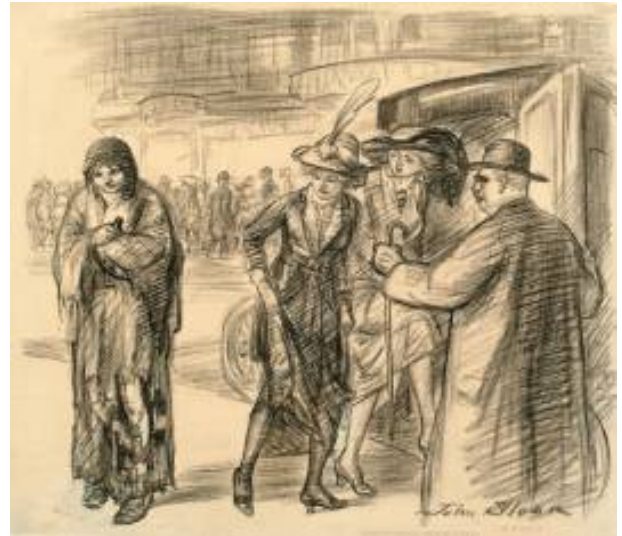
Circumstances Alter Cases: "Positively disgusting! It's an outrage to public decency to allow such exposure on the streets!"

John Sloan's use of architecture in his drawings, prints, and paintings help us in clearly defining the settings of his works. Have students take a photograph of an important intersection in their town or city. How would future historians interpret this photograph? What comment might they make on the significance of the various buildings to those living in the community?